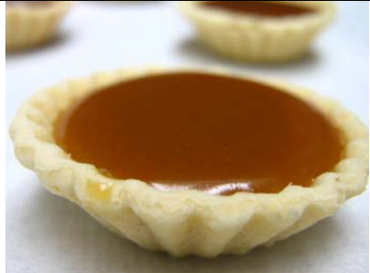
Mini caramel pie $2/pc