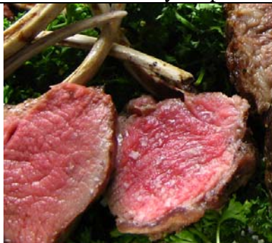
Lamb Lollipop $4/pc

in coconut and peanut crust, curry dipping sauce ($2) hot