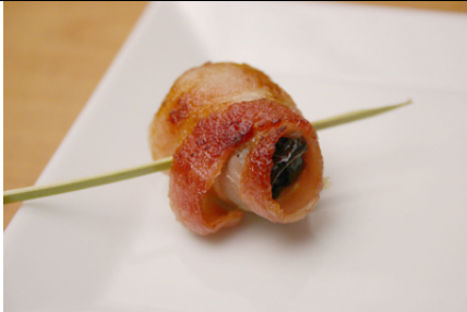
Bacon wrapped prune $2

Prosciutto wrapped honey marinated figs, drizzled with Port reduction ($2) cold