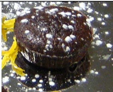
Mini chocolate cake $2

crème patissiere filling, dulce de leche spread in a choux pastry puff, condensed milk dip ($2) cold