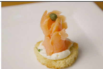
Smoke Salmon toast $2

5 prawns on a saucer with tomato-based dip ($9) cold