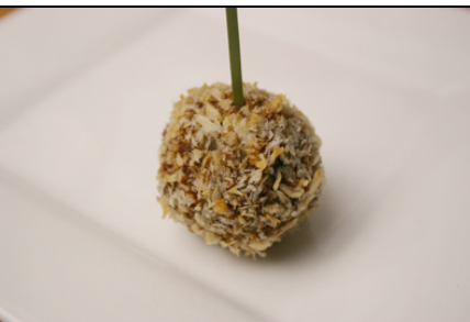
Meat Ball $2

Goat cheese and fresh vegetables ($2) cold