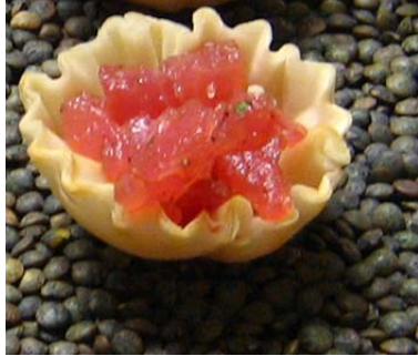
Tuna Tartare $3