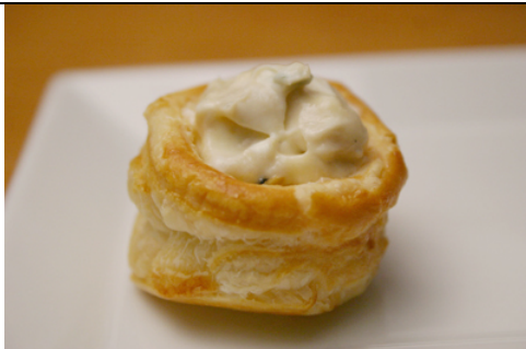
Bouchee a la Reine $3

asparagus heads wrapped in a puff pastry “blanket” with goat cheese filling ($2) hot