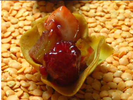
Mini berries basket $2/pc