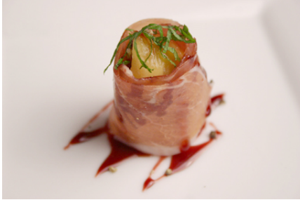
figs and pigs $2