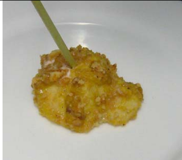
Chicken Satay $2/pc

Yellowfin tuna in its sesame/soy/mint sauce, on a spoon ($3) cold