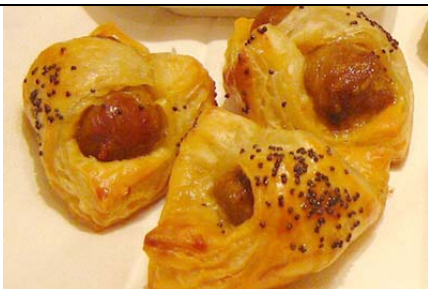
Lams in a blanket $2/pc

yogurt marinated chicken, roasted and served on a skewer with hot sauce on side, Indian style ($2) hot