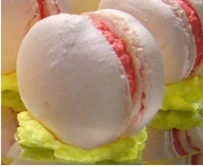
Mini macaron $3/pc