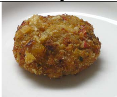
Crab cake $2

1 oz slice over mushroom cream (the meat is marinated in Bourbon), ($4/slice) hot