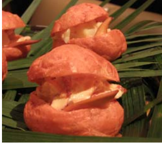
Lobster roll $2