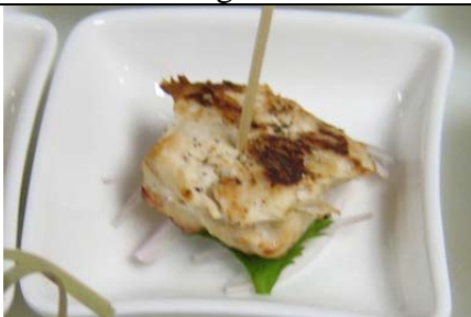
Malai Tikka $2

cheese puffs, a specialty of Burgundy, France ($2) hot