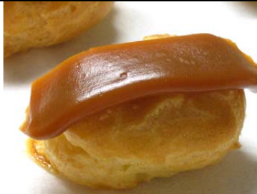
Mini éclair $2