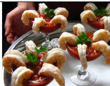
Shrimp Cocktail $9/5 prawns

bite-sized lamb chops, dipping sauce ($4) hot