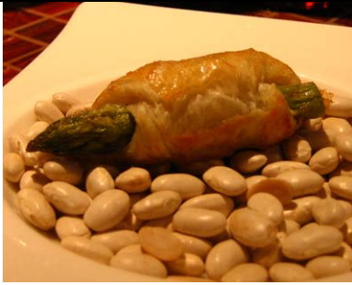
Asparagus in a blanket $2

sirloin beef, raw, with spices and condiments, served on a spoon ($3) cold