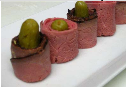
Roast beef wrap $2

beef, bacon and gruyere in cheese puff buns($4) hot