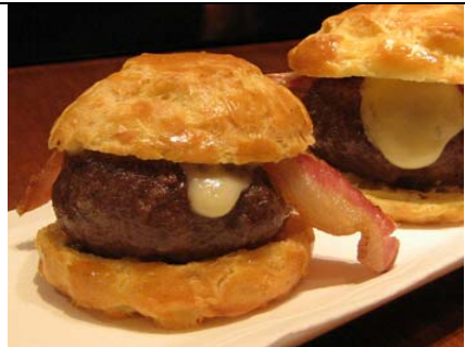
Mini bacon & cheese Burger $4

faggot of minced vegetables, white dipping sauce ($4) cold