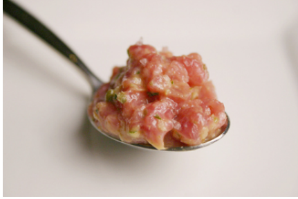
Steak Tartare $3