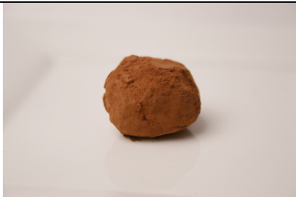
Chocolate Truffle $2